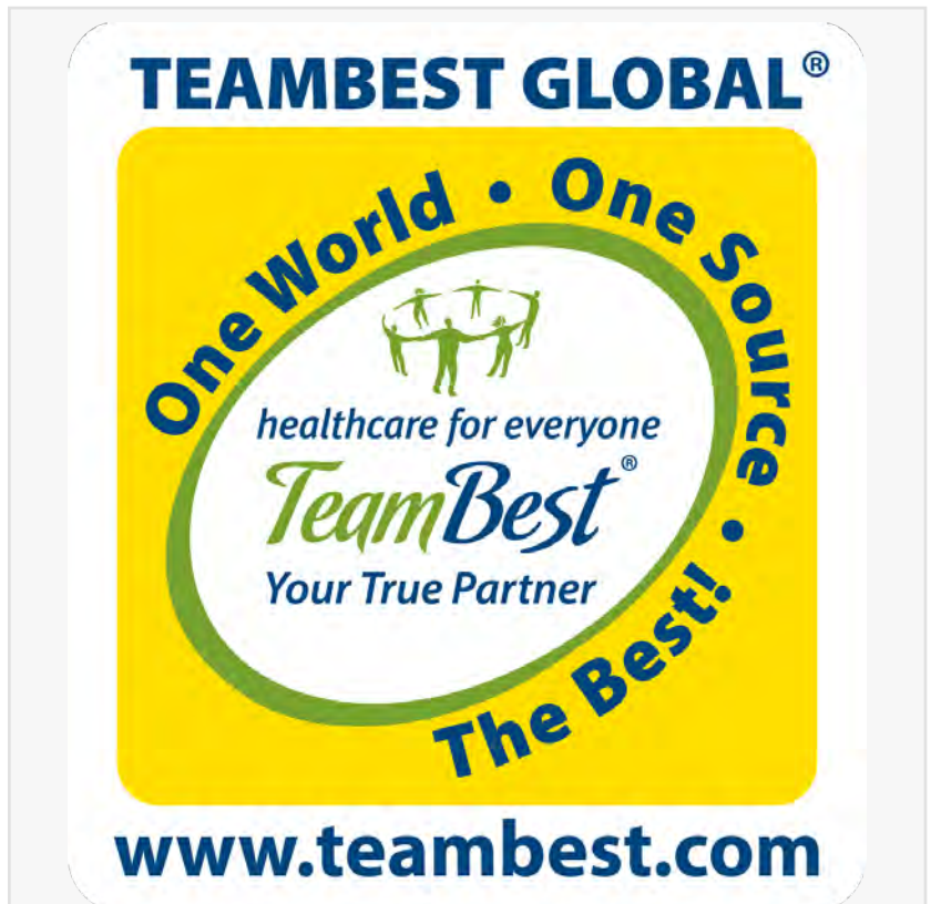
TeamBest Global Companies logo — www.teambest.com