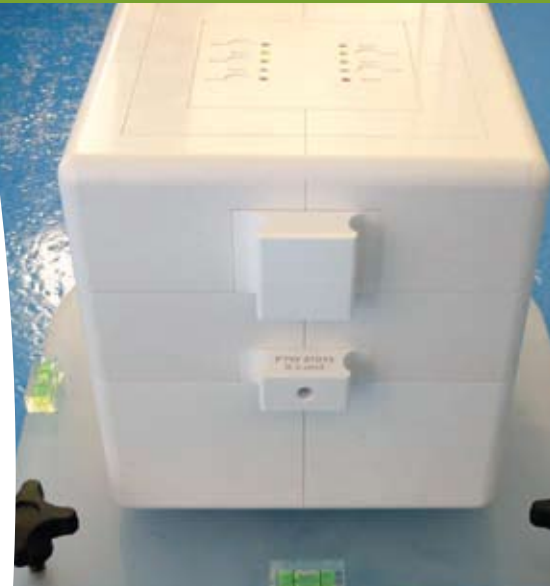
MOSFET Calibration Phantom Prototype